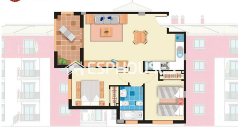
Puerto Marina Modelo F