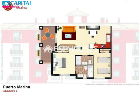
Puerto Marina Modelo E