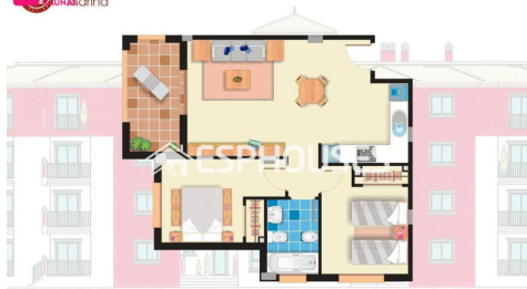
Puerto Marina Modelo F