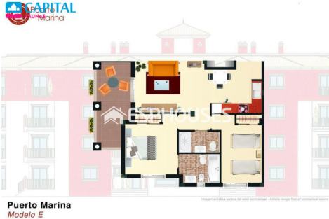
Puerto Marina Modelo E