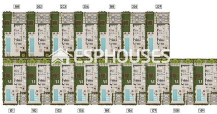
GROUP FLOOR PLAN